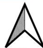
STUMPCROSS LANE INSET WATER SUPPLY MAP 1