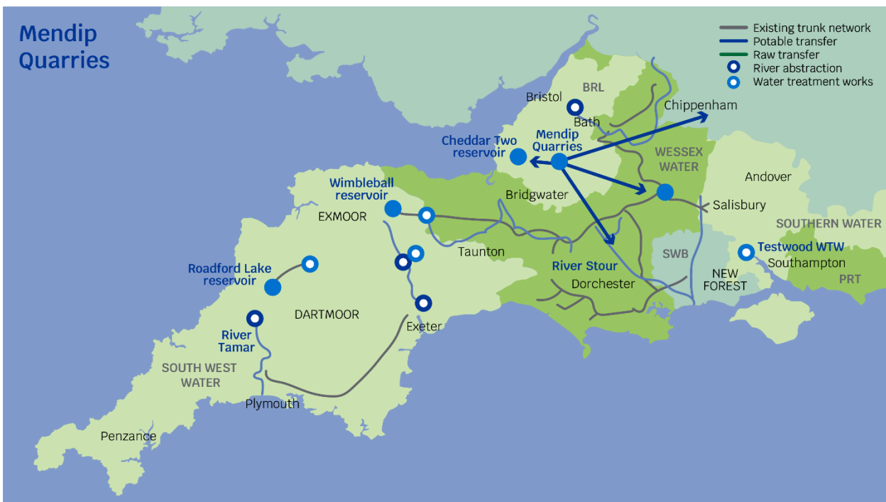
Figure 1. The Mendip Quarries Reservoir Solution and Transfer Options

Further information concerning the background and context of the Wessex Water and South West Water Mendip Quarries can be found in the Mendip Quarries publication document on the Wessex Water 1 and South West Water 2 websites.