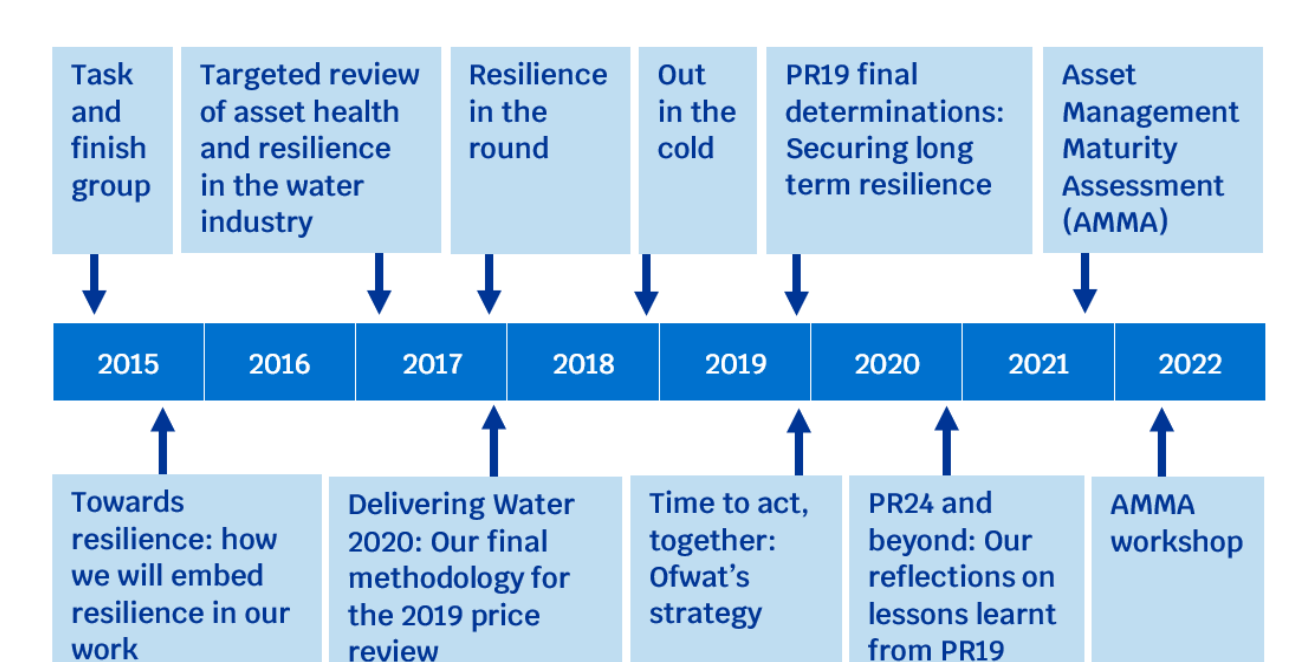
Figure 1.1 Key work on operational resilience

While companies are responsible for ensuring they deliver operational resilience, we have a role in challenging the sector to do this effectively and efficiently. We are actively engaging and promoting resilience across the sector, developing and disseminating key planning principles and general good practice (see figure 1.1). Since 2015 our work has covered different aspects of operational resilience, <sup>18</sup> from incident investigations, to planning guidance, or themed publications such as the targeted review of asset health <sup>19</sup> and our recent asset management maturity assessment (AMMA). <sup>20</sup>