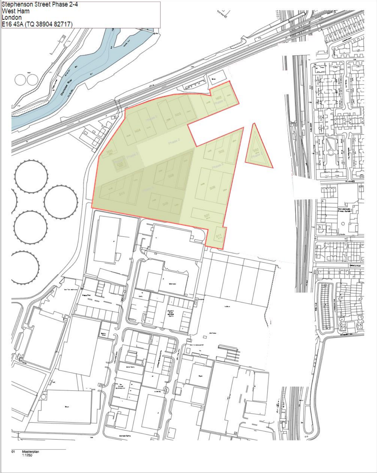
PLAN REFERRED TO IN THE VARIATION OF THE APPOINTMENTS OF LEEP NETWORKS (WATER) LTD AND THAMES WATER UTILITIES LIMITED, AS WATER UNDERTAKERS, MADE BY THE WATER SERVICES REGULATION AUTHORITY ON .....